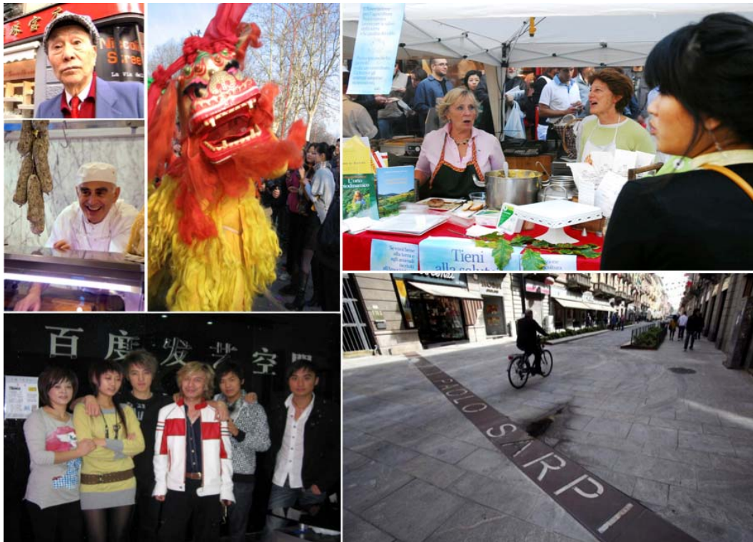
Figure 2. The urbanity of Paolo Sarpi's neighborhood